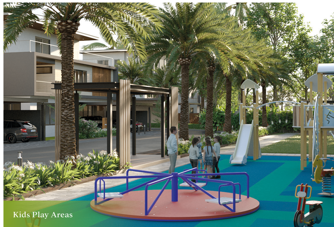
Kids Play Areas